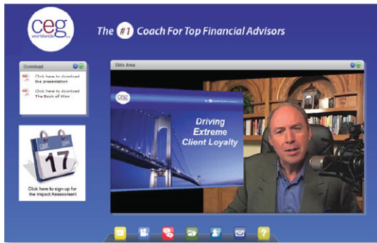
CEG Webinar: Driving Extreme Client Loyalty

ON24 has successfully helped financial services companies lead the way in the growing online information marketplace for over a decade. With a substantial history of serving heavily regulated industries, ON24 understands what it takes to satisfy government regulatory, compliance, and customer-data confidentiality requirements.